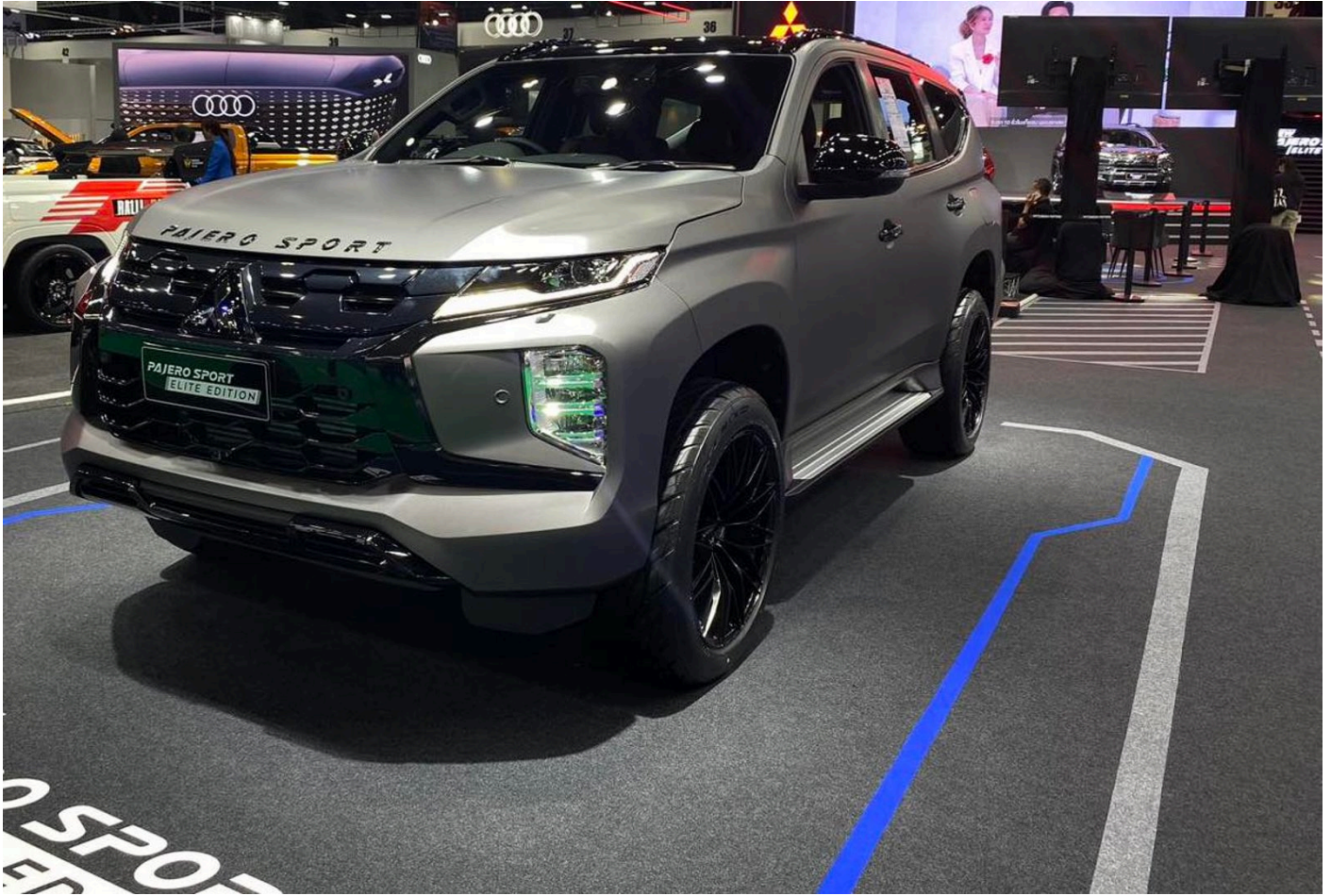
MY2025 MITSUBISHI PAJERO SUV SPORT ELITE EDITION 2.4L 4X4 6AT